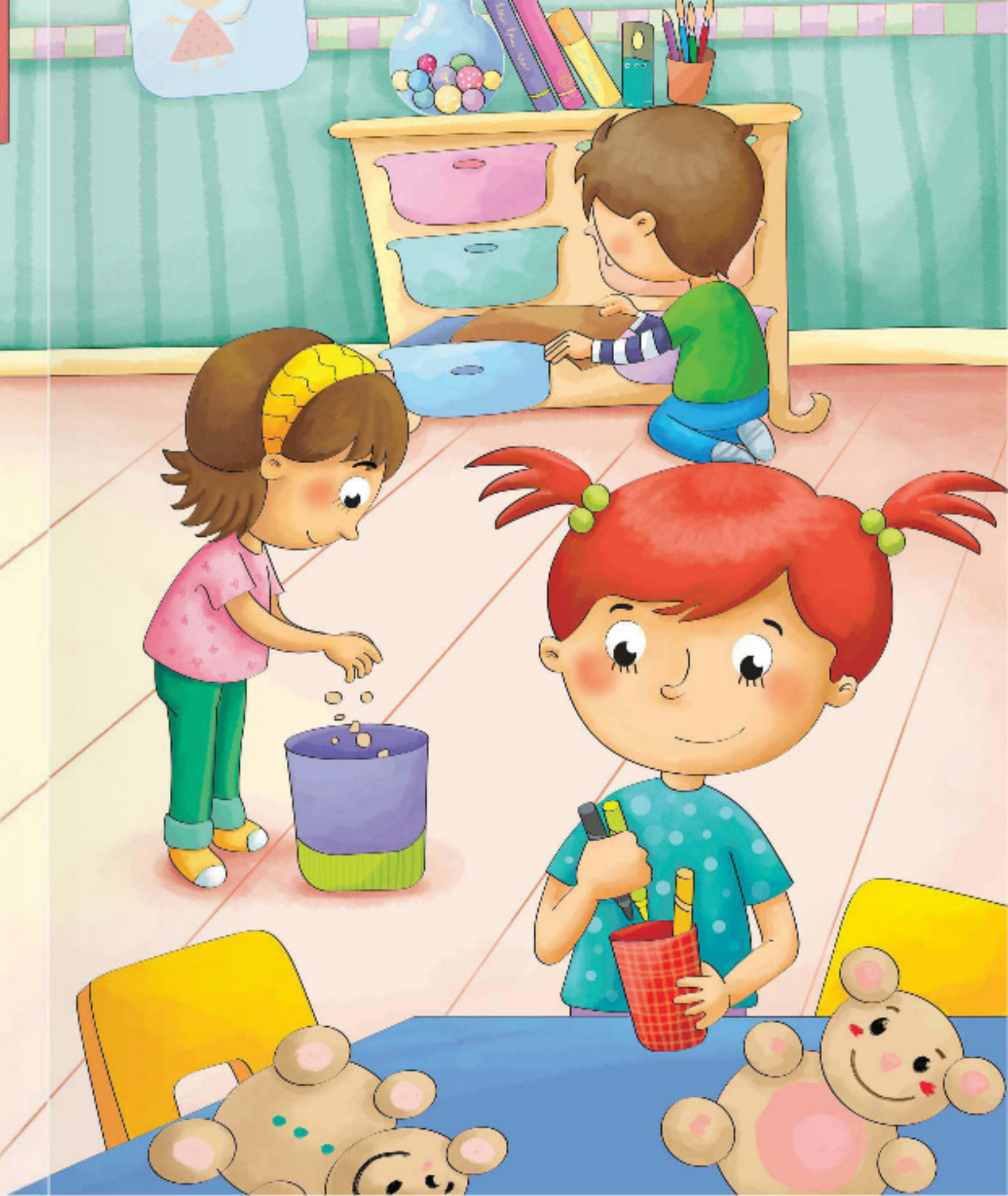
Kate follows instructions.