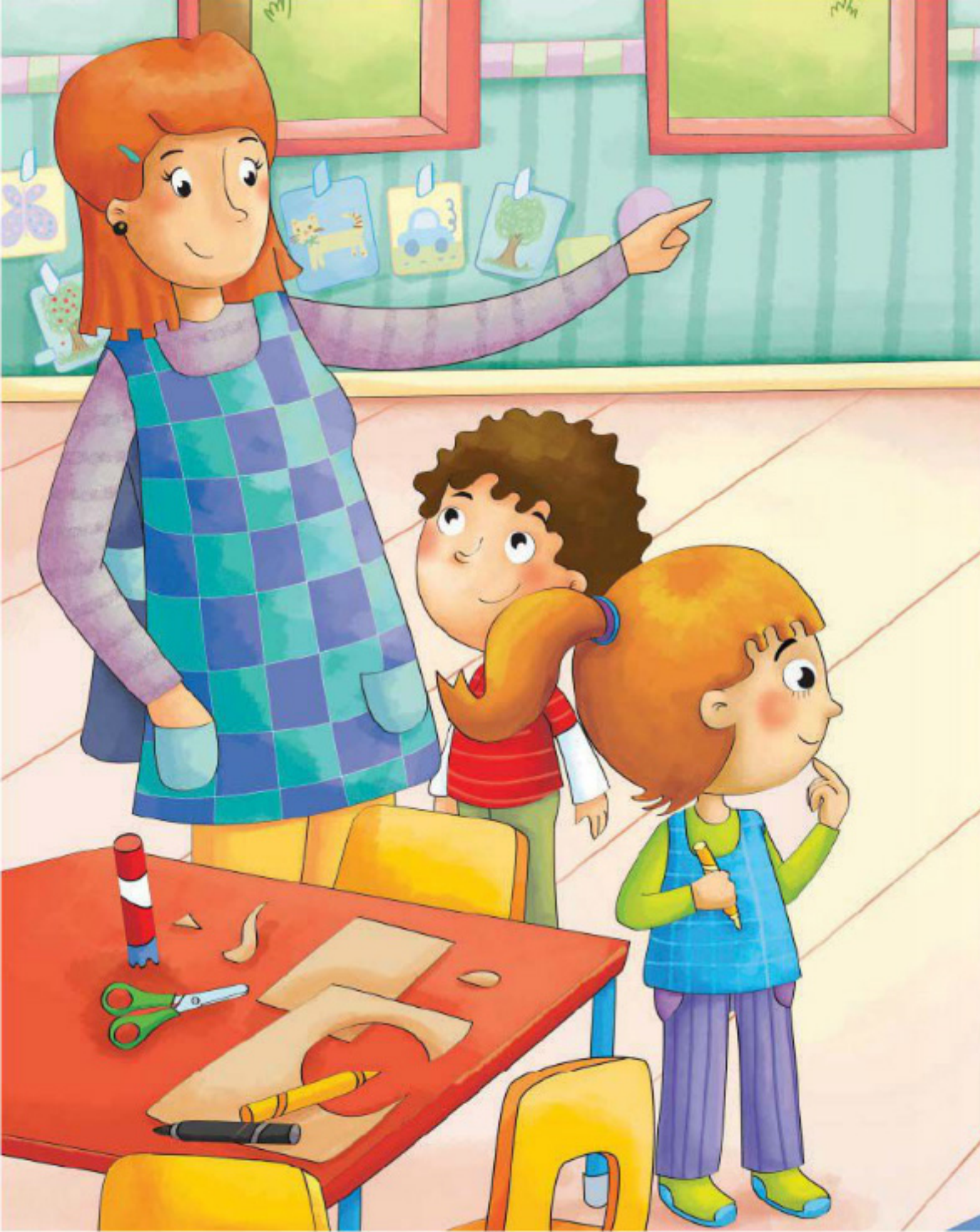
The teacher says, "Clean up."